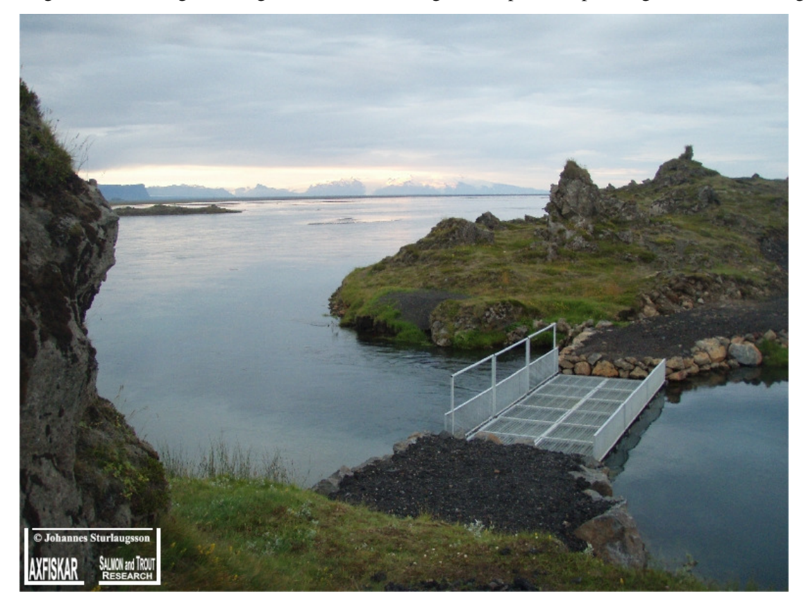
Fig. 1. The mouth of River Tungulaekur where it opens into the glacier river Skafta. The mysterious forms of lava field is embracing the river mouth and in distance Glacier Vatnajokull can be seen. The bridge over the river is the top of the counter facility unit.

Tungulaekur is a small spring fed river in the central south of Iceland. It is one of the tributaries to the glacial river Skafta (Fig. 1). River Tungulaekur enters River Skafta approximately 20 km from the estuary where River Skafta opens into sea. Therefore sea trout from River Tungulaekur have annually to migrate trough that glacial water when heading for their feeding grounds in sea and again when returning from sea during their migrations to River Tungulaekur prior to spawning and overwintering.